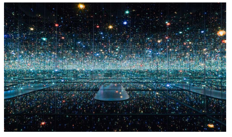
Yayoi Kusama, Infinity Mirrored Room- The Souls of Millions of Light Years Away, 2013