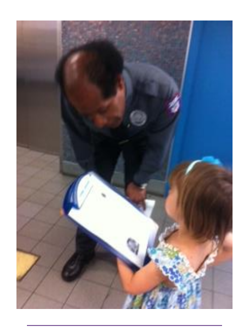
Eliza asks the security guard, "What is your job?"

NYSPLS Standard: PK.SEL.3. Demonstrates and continues to develop positive relationships with significant adults (primary caregivers, teachers, and other familiar adults)