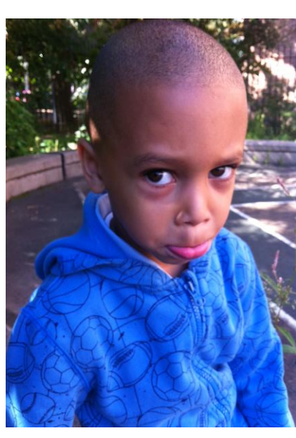
"I feel sad when it's raining."